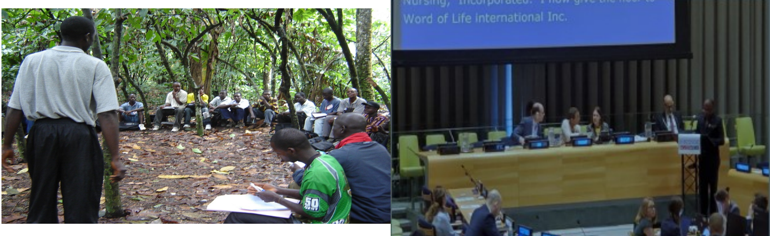
WLI—Another Cooperative Development Training in Grand Gedeh County, Liberia