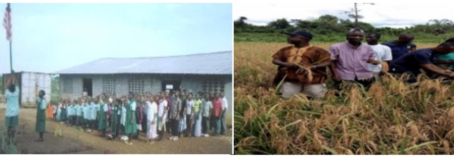
WLI—Our hope is in educating the children