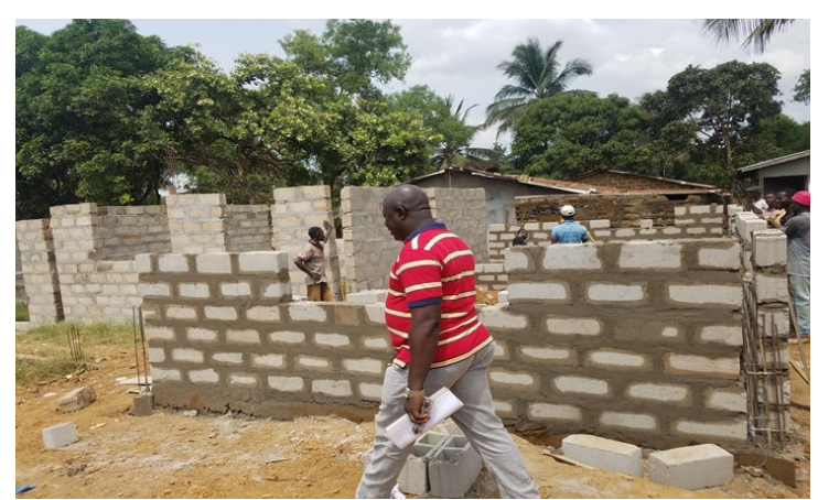
WLI—School Construction Project in Monrovia