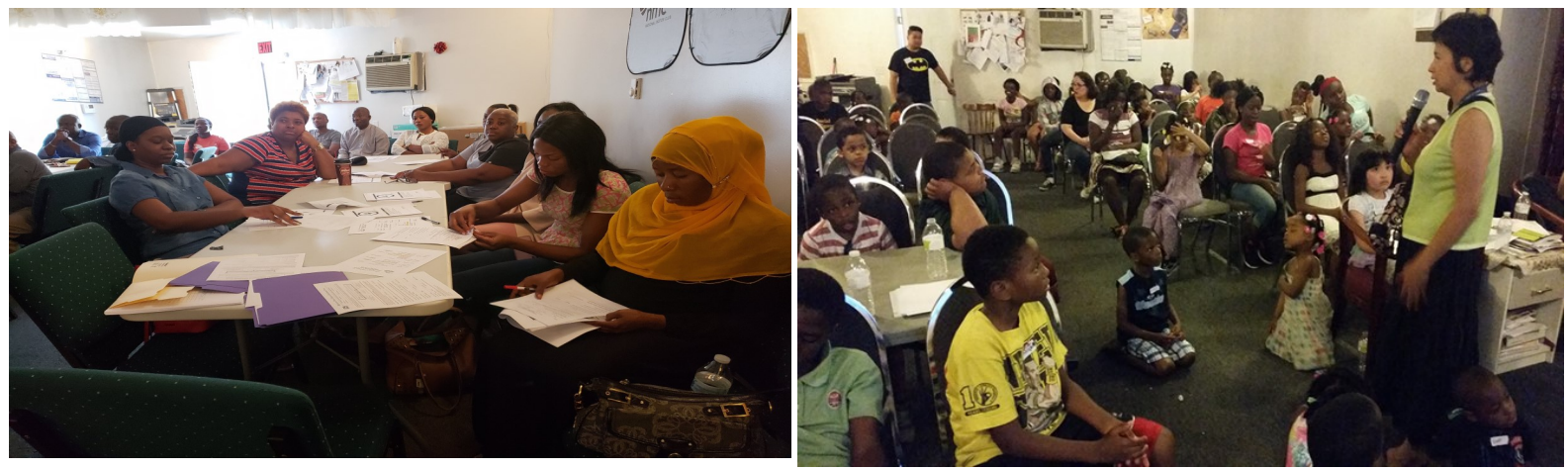
WLI—Staff Training in the US Office